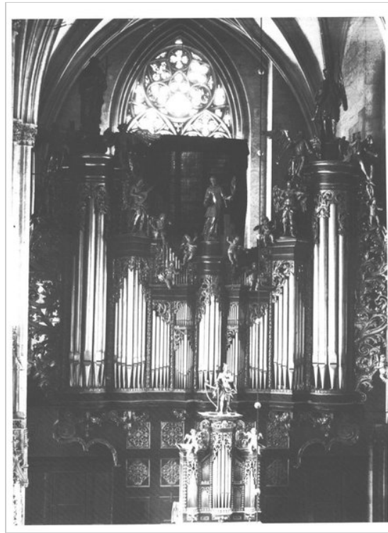
Case of the great organ at St. Stephen’s Cathedral (1720), destroyed in 1945.

throughout the nineteenth century and was completely replaced in 1886. Römer’s original case of 1720 was retained (see illustration), but this perished along with the choir organ in a devastating fire in April 1945.