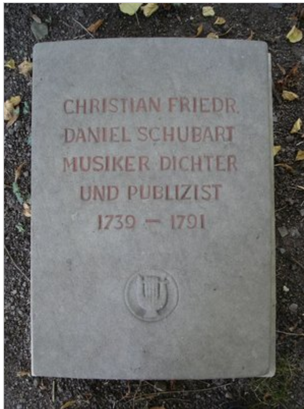
Schubart's Gravestone, Hoppenlau-Friedhof, Stuttgart

Schubart died on 10 Oct 1791, as reported by his son Ludwig in the issue of 11 Oct . Ludwig promised to continue publication of the Chronik “nach dem bisherigen Plan und im bisherigen Tone” (“according to the previous plan and tone”); true to his promise, the periodical continued to appear through at least the end of 1792 under the title Fortgesetzte Schubart'sche Chronik .