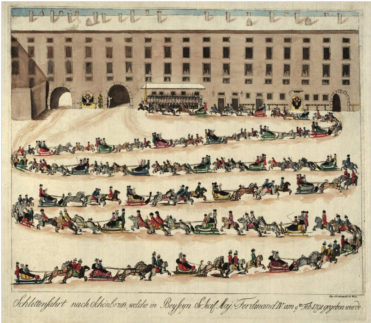
Johann Hieronymus Löschenkohl, Die Schlittenfahrt nach Schönbrunn für König Ferdinand IV. von Sizilien am 9. Februar 1791 ( Wien Museum )

This was the final performance in this production of Figaro , and the last in Vienna during Mozart's lifetime.